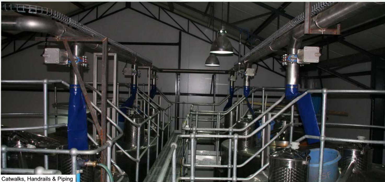
Catwalks, Handrails & Piping