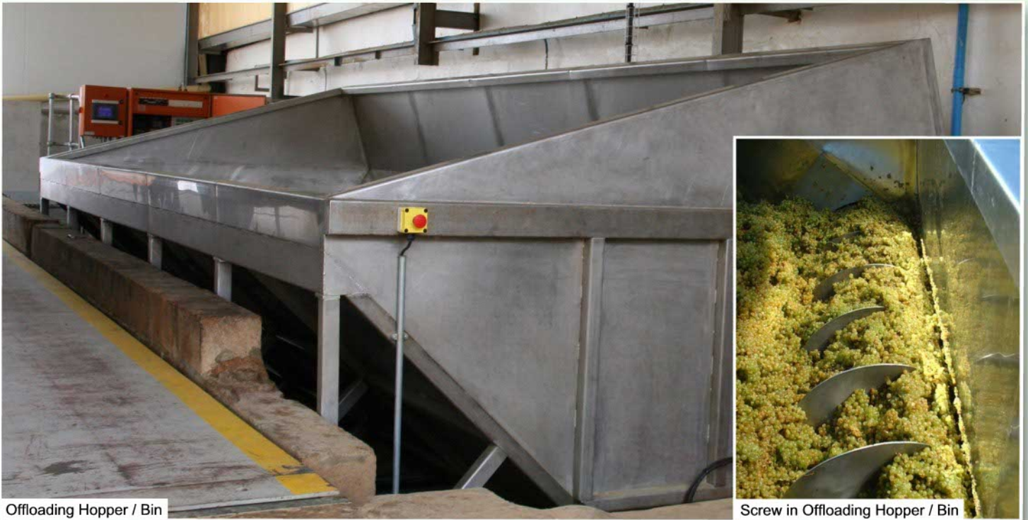
Offloading Hopper / Bin