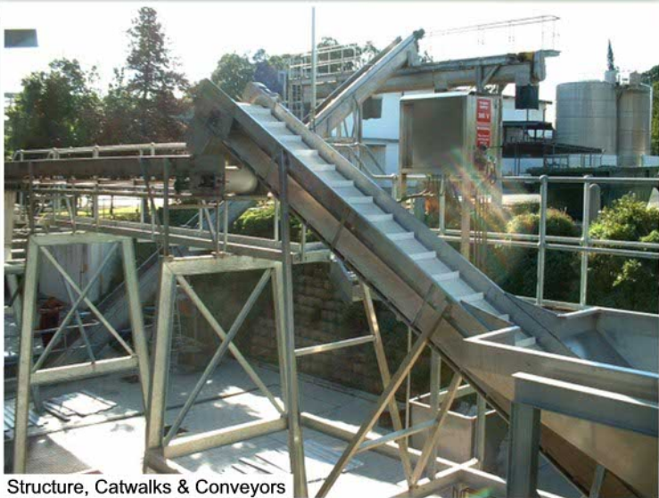
Structure, Catwalks & Conveyors