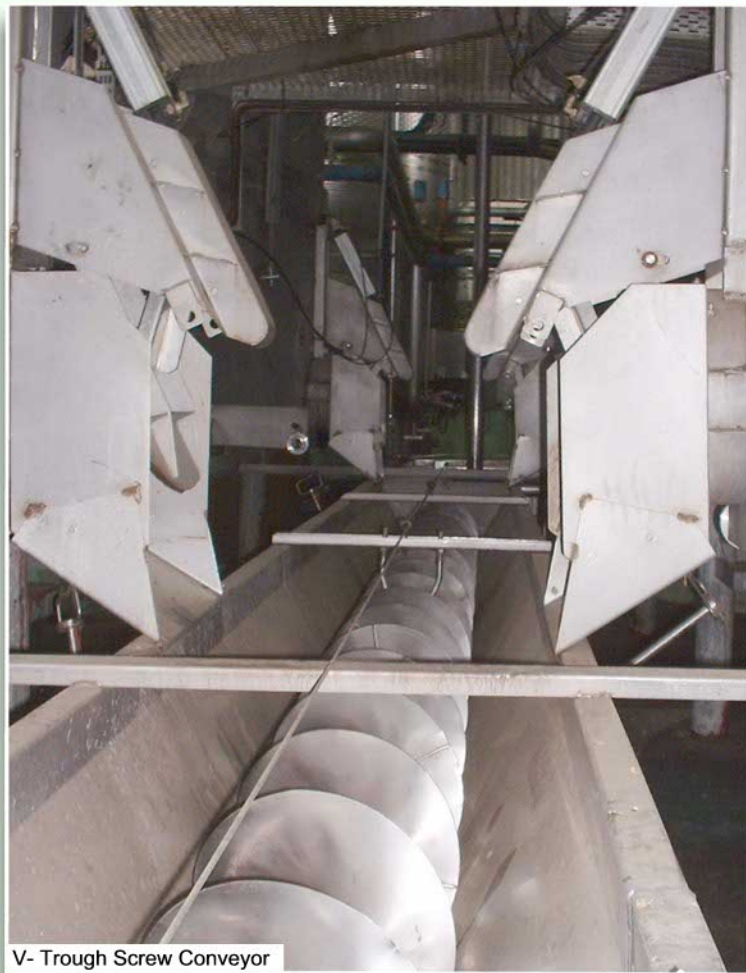
V- Trough Screw Conveyor