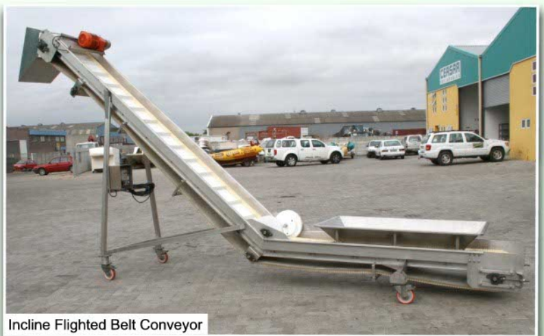
Incline Flighted Belt Conveyor