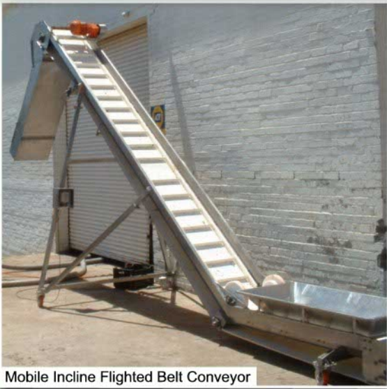
Mobile Incline Flighted Belt Conveyor