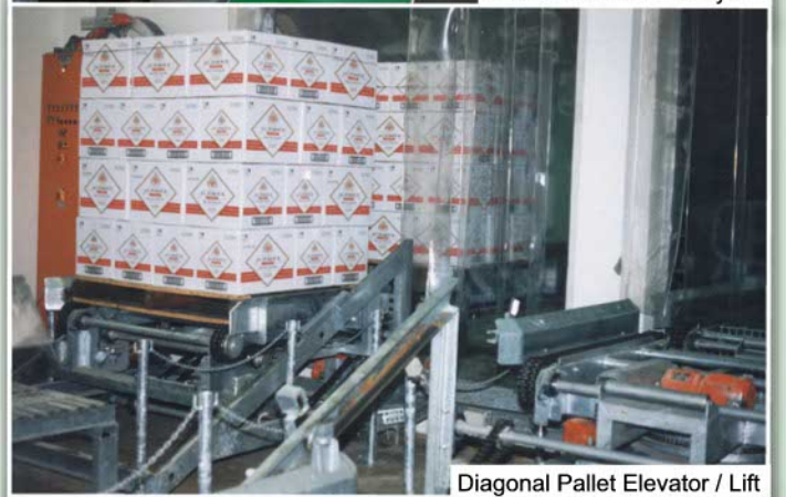
Diagonal Pallet Elevator / Lift