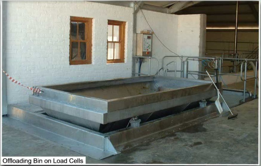
Offloading Bin on Load Cells