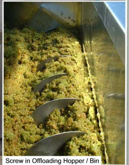
Screw in Offloading Hopper / Bin

Wine Industry Conveyor Systems are specifically designed to clean and process the grapes for wine making. The grapes are normally introduced into the system in crates / trucks, which are tipped into Offloading- Hoppers / Bins. From there the grapes are conveyed into the presses, crusher destemmers, or tanks by means of Belt Conveyors or Screw Conveyors and fed into the system for processing.