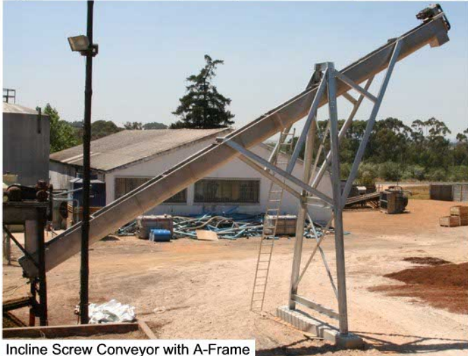
Incline Screw Conveyor with A-Frame