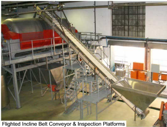
Flighted Incline Belt Conveyor & Inspection Platforms