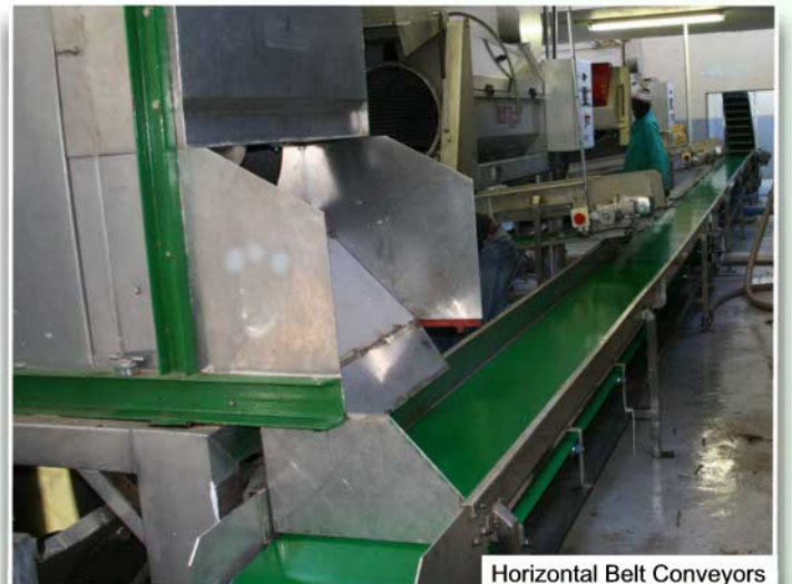
Horizontal Belt Conveyors