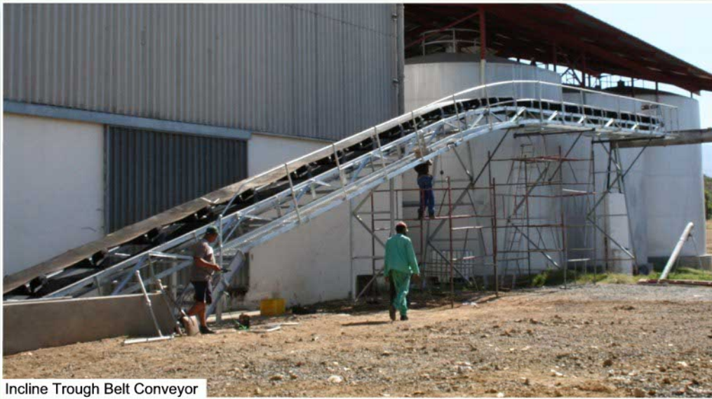
Incline Trough Belt Conveyor