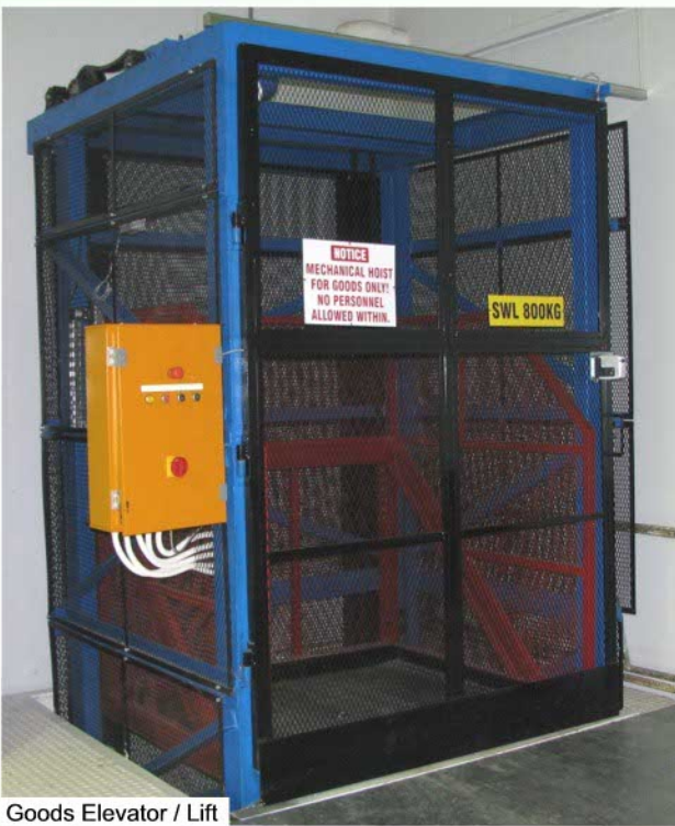
Goods Elevator / Lift