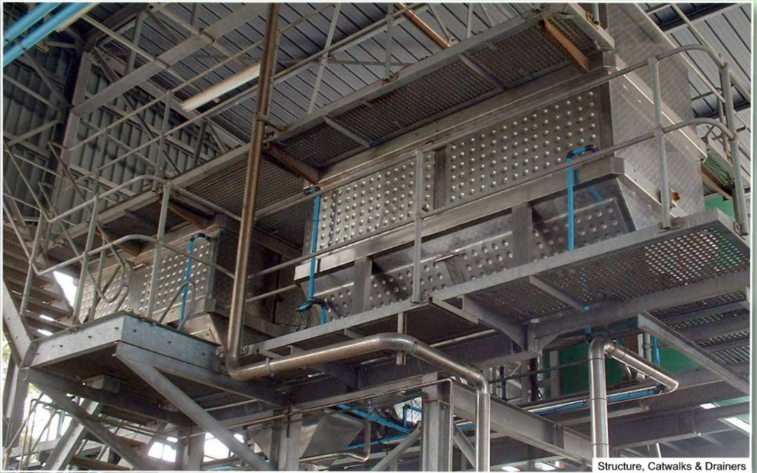
Structure, Catwalks & Drainers