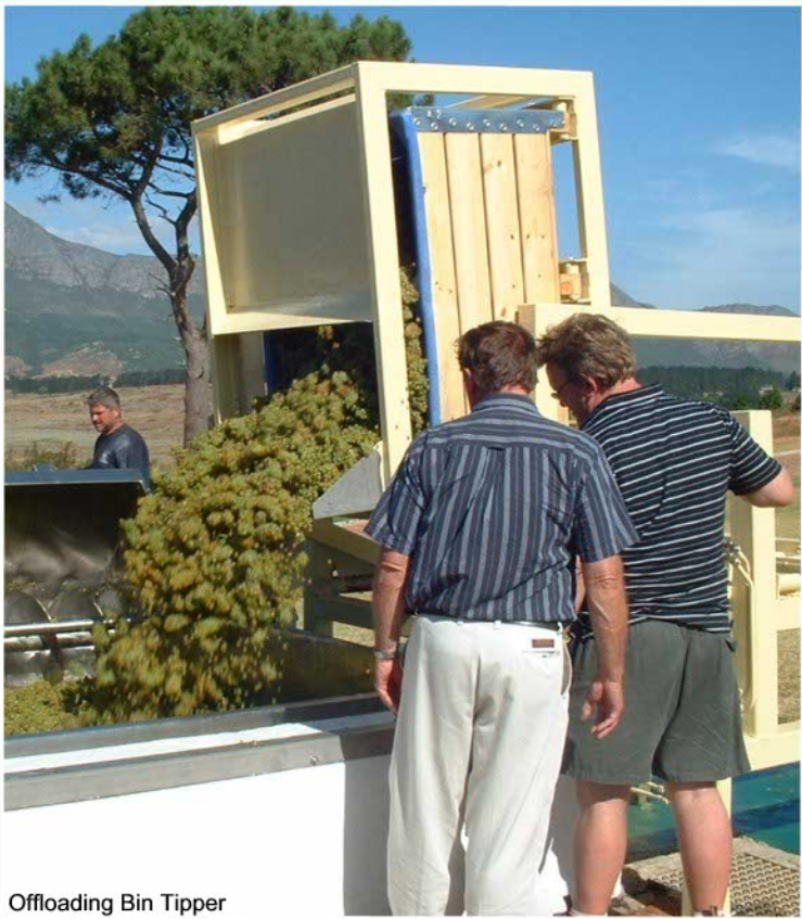
Offloading Bin Tipper